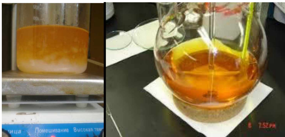
Fig. 4. Washing and distillation process