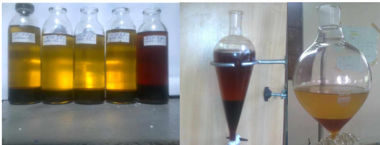
Fig. 3. Transesterification process result