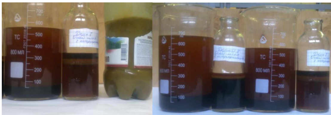
Fig. 2. Esterification process results

It needs to use methanol and Sodium Hydroxide as catalyst (fig. 3) show two layer separation between glycerol and FAME: