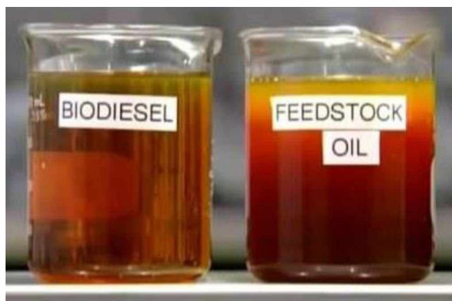
Fig. 5. Biodiesel and feedstock oil