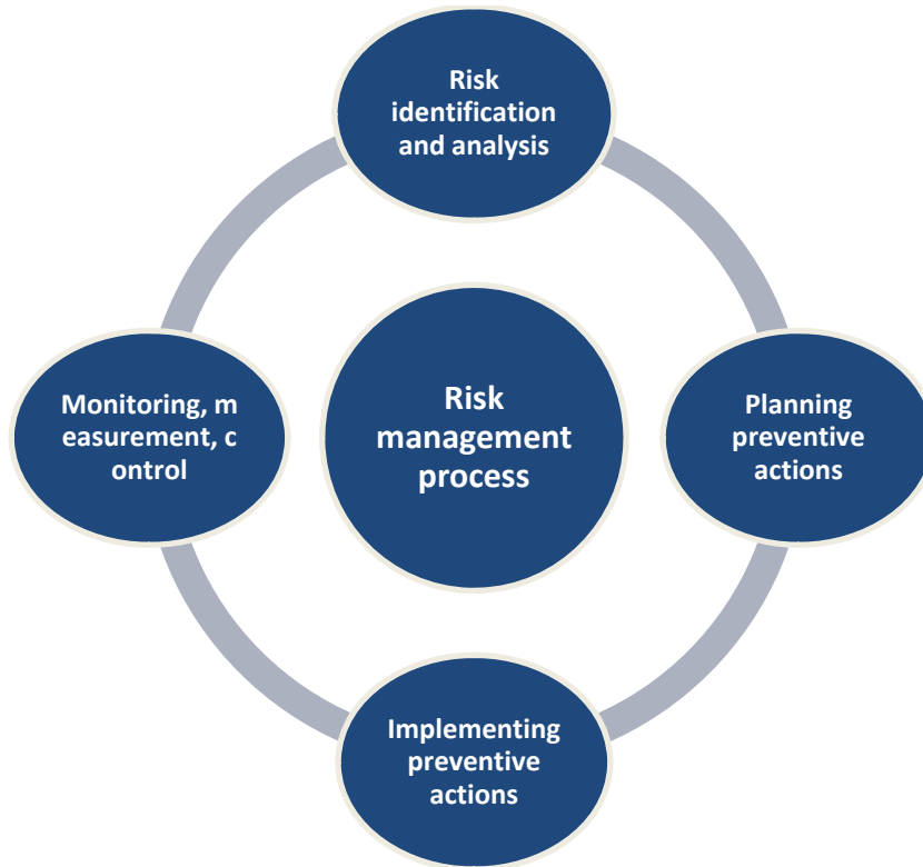
Fig. 2. The risk management process

The organization must plan actions for risk response and opportunity response and the way of integrating and implementing those processes.