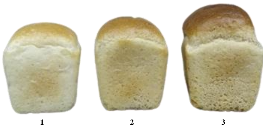
Figure 1. Breads:

1, control (without additives); 2, with 15% mixture of sprouted grains to the mass of flour; 3, with 15% mixture of sprouted grains and 1.8% multi-component baking improver to the mass of flour.