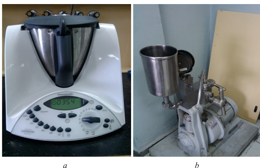
Fig. 1. Thermomix VORWERK mixer (a) and

The appearance of the specified equipment is shown in Fig. 1 .